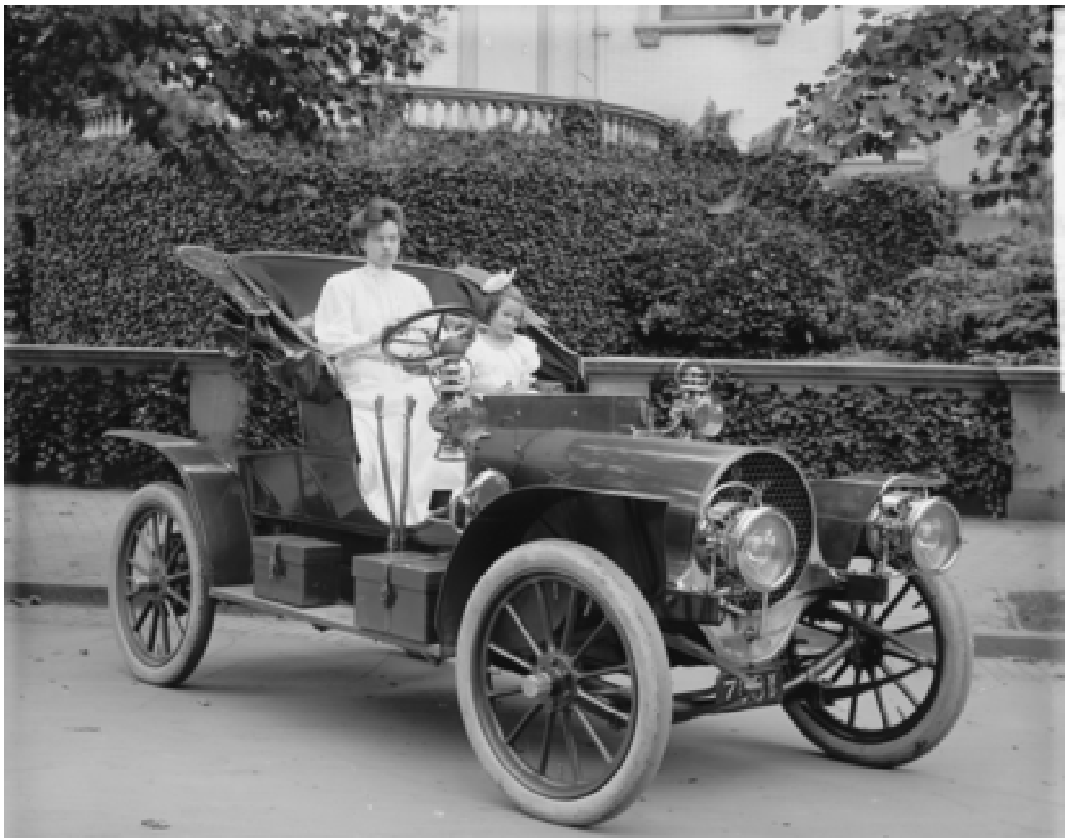
Figure 1: 1907 Franklin Model D roadster.